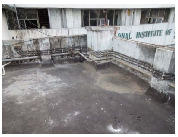
After cleaning of the rooftop, NICED-I building